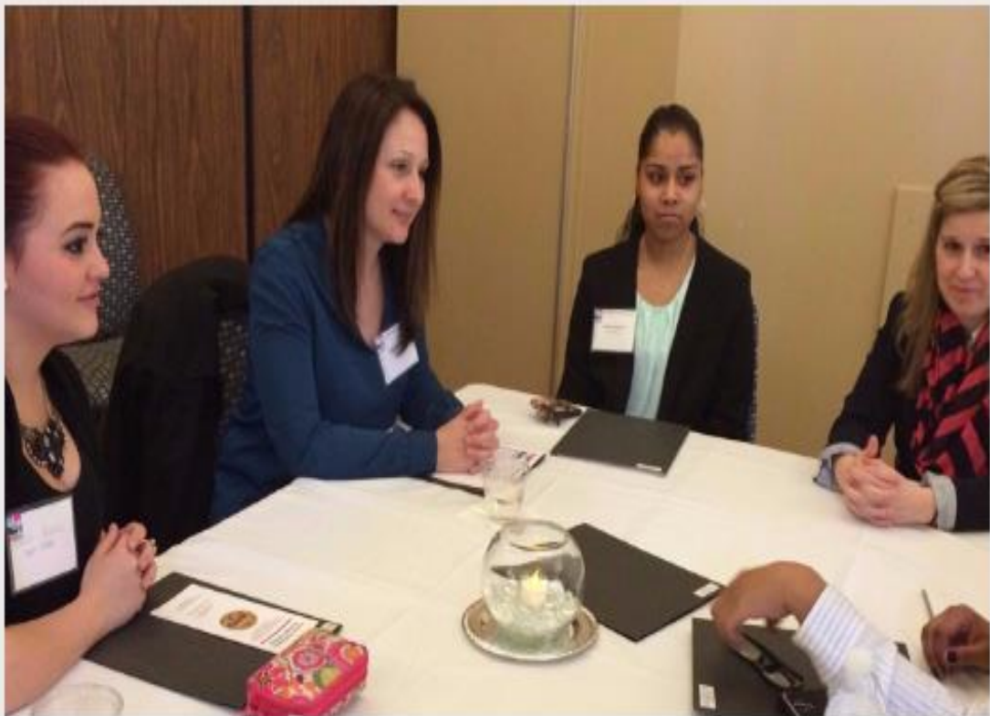
Students engage in a round table discussion with a panelist at the Legal Studies Career and Networking Event, hosted on Tuesday, March 31st.