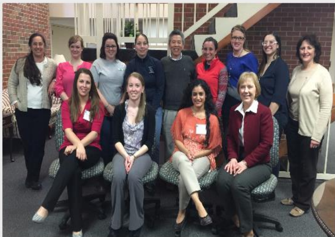
Panelists at the Science Career and Networking Event, hosted on Wednesday, March 25th, pose for a group photo.

Between March and April, the Sullivan Career and Life Planning Center, along with department faculty, hosted three Career and Networking Events for undergraduate students.