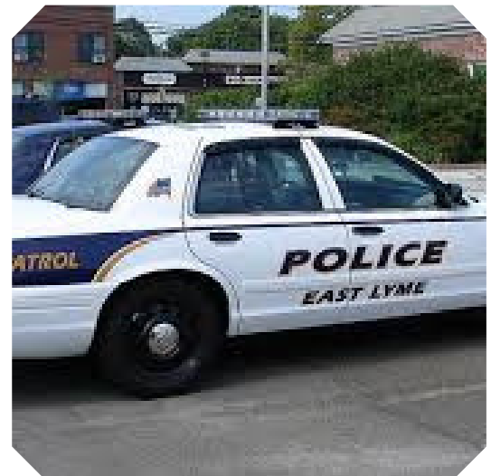
East Lyme Police Department, Niantic, CT