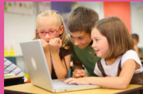
Students at ERFC