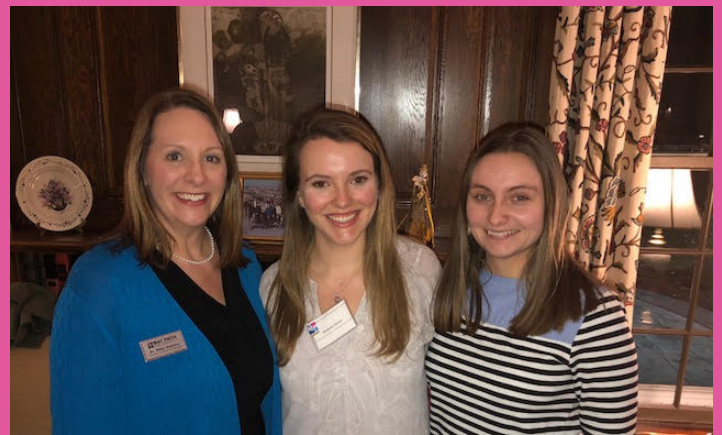
Faculty & Students