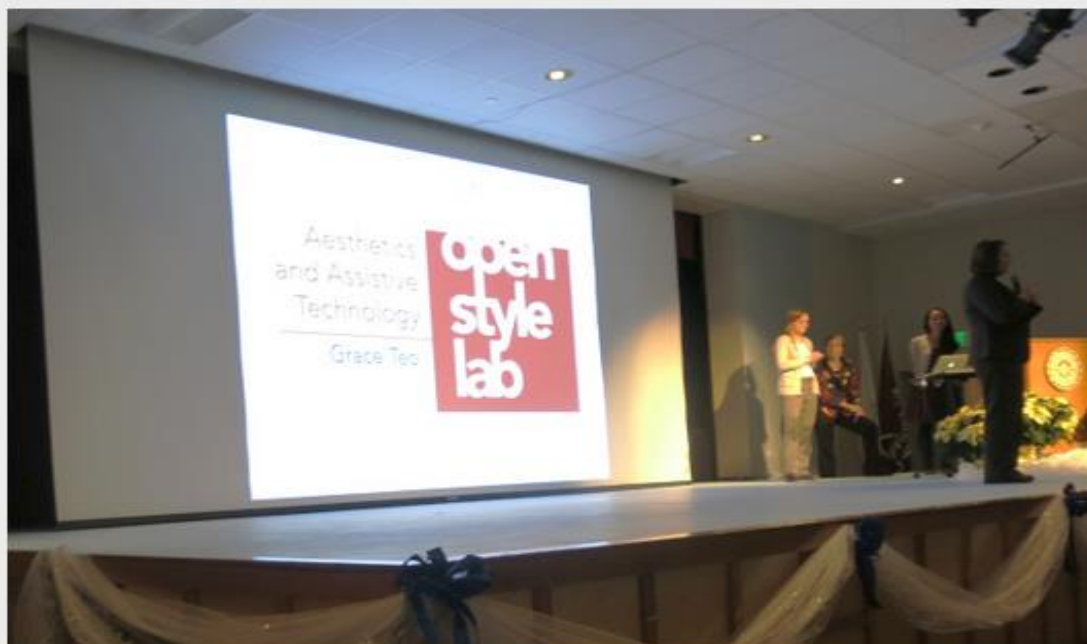
Open Style Lab , sponsored by the MIT Assistive Technology Club, discuss their latest efforts to team up design, engineering, and occupational therapy students in creating clothing solutions for people with disabilities or their caretakers.