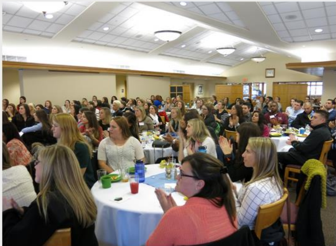
Students enjoy lunch while listening to a panel discussion by program alumni.