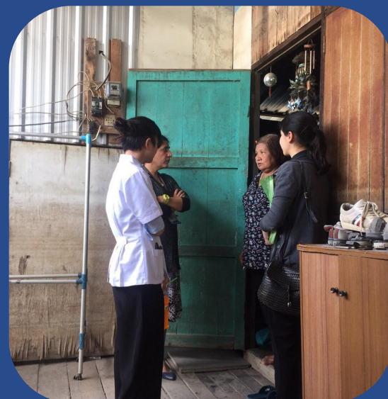
NIPAO'S PATIENT HOME VISITING SESSION