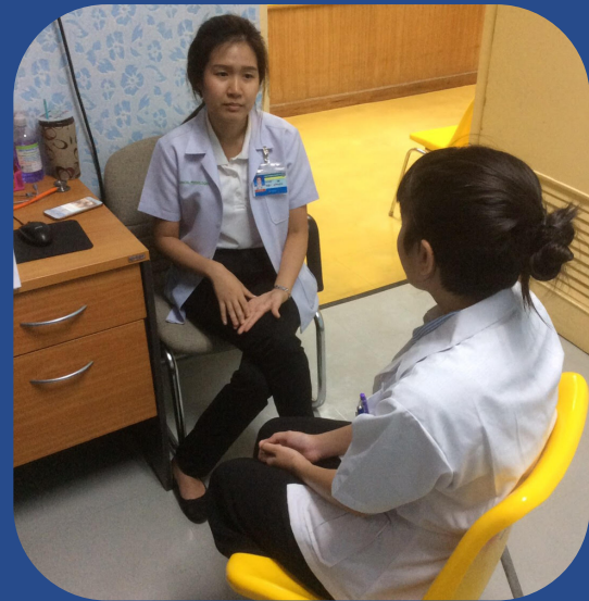
NIPAO'S CLINIC SESSION IN THE HOSPITAL