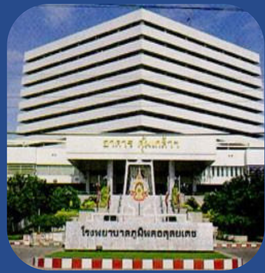
Bhumibol Adulyadej Hospital Bangkok, Thailand

Advice to future interns, “Always express passion about the jobs you're given. if you feel a question may not be the best, still consult with someone because it will show your willingness to learn.”