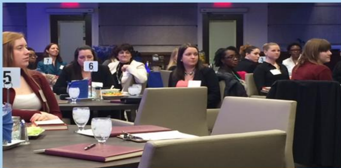
BPC students at the Lean In Leadership Book Club Dinner