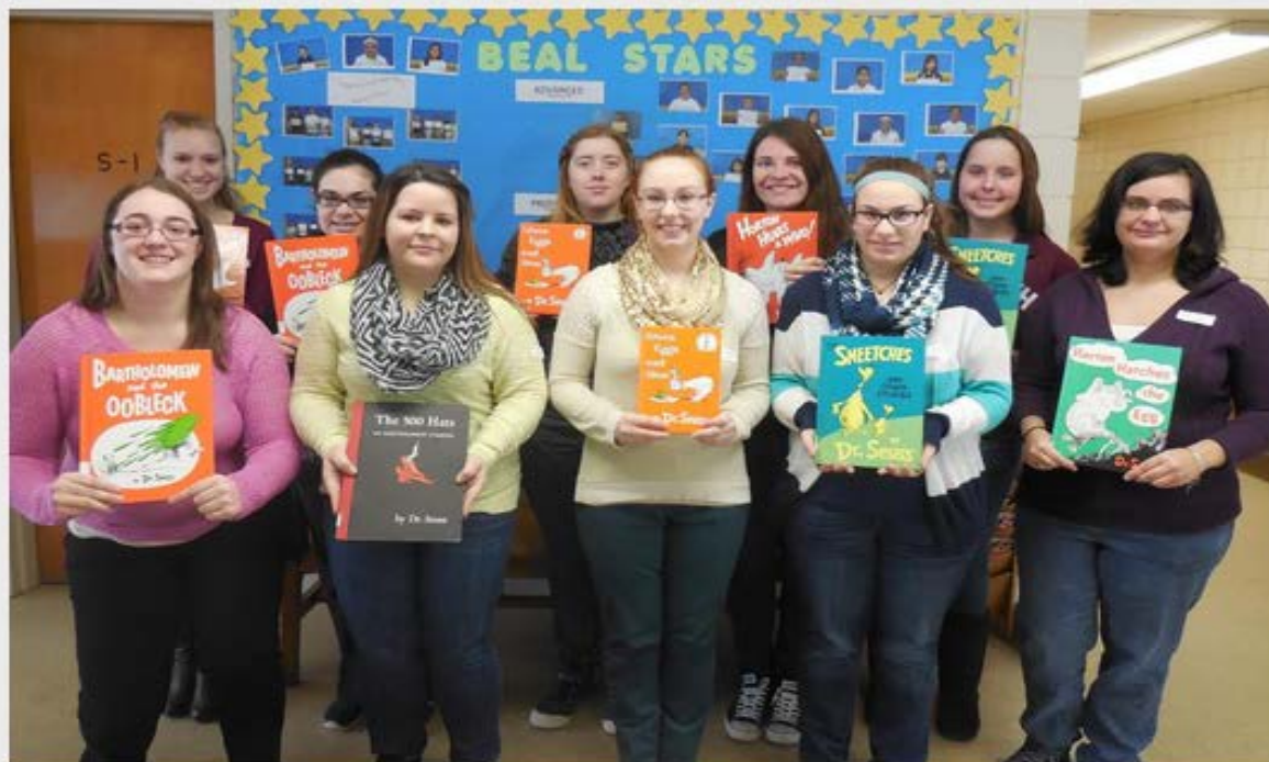
Students from the Education Club's Read Across America program.

The upcoming Education Career and Networking Event on Thursday, March 27 th , will provide students enrolled in the Education program with further opportunity to expand their network and learn more about this field!